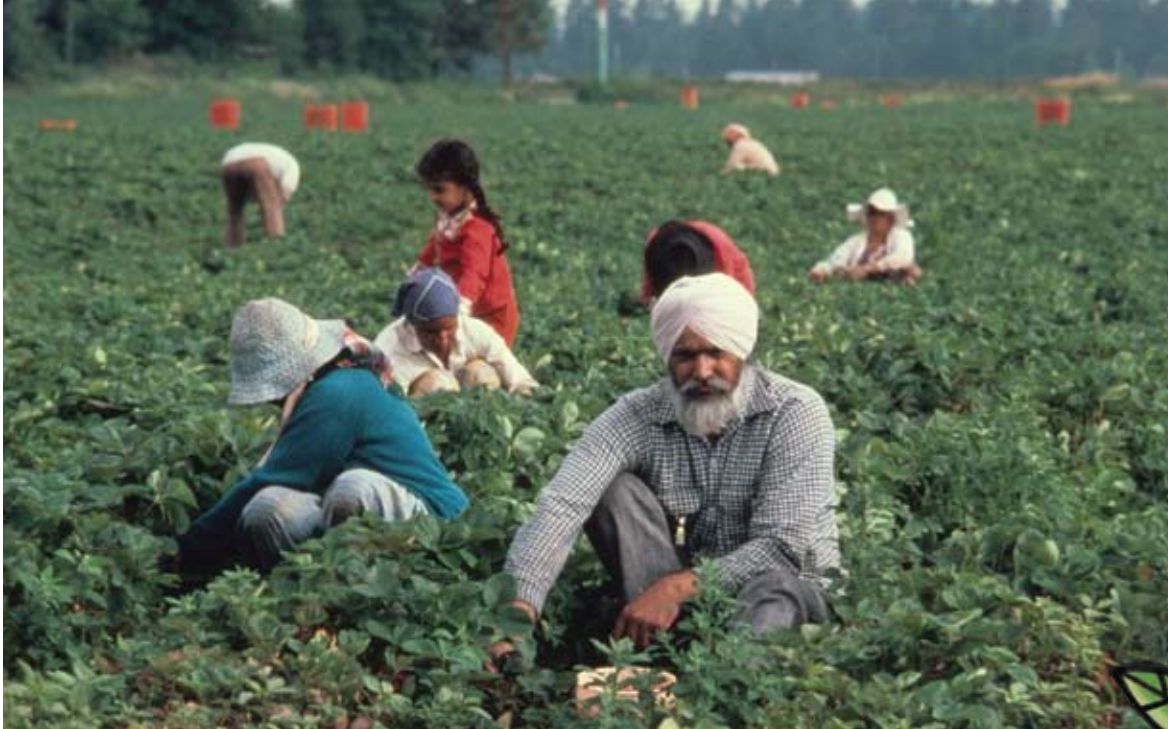
Children in the fields during strawberry harvesting, Fraser Valley, BC. Circa late-1970s.