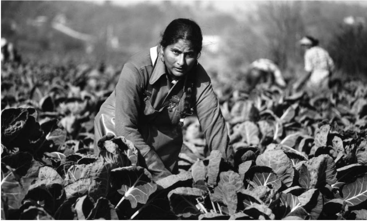
A field worker tops Brussels sprout suckers before harvesting in Aldergrove, British Columbia, 1983.

drivers, artists, security guards, fishermen and newspaper carriers were brought under the legislation.