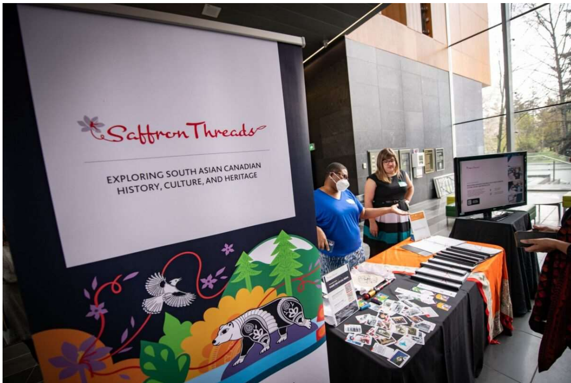
South Asian Canadian Legacy Project – Surrey Unveiling South Asian Canadian Legacy Project – Surrey Unveiling

The project was funded by a $1.14 million grant from the Province of British Columbia along with support from the Abbotsford Community Foundation. SACLP is part of the government's response to community consultations on racism and hate that were held in 2019.