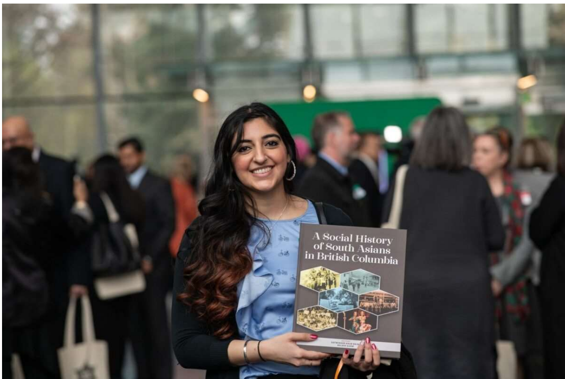
South Asian Canadian Legacy Project – Surrey Unveiling

Those wanting to further explore the history of South Asians across the province can download an e-book copy of A Social History of South Asians in British Columbia . Nineteen authors came together to thread South Asian Canadian stories from 1897 to the present moment.