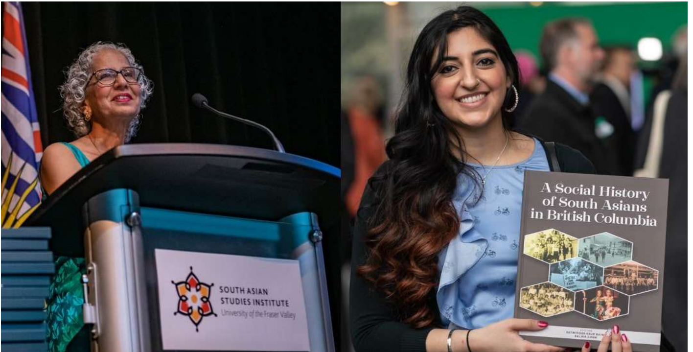
South Asian Canadian Legacy Project - Surrey Unveiling (UFV/Submitted)