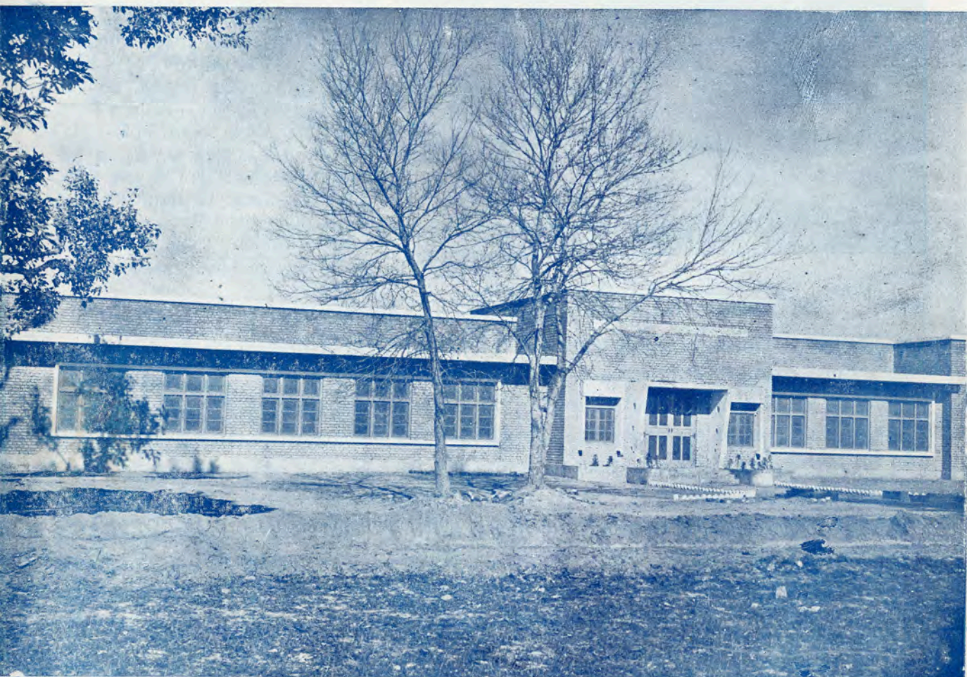
Magnificent view of the newly built building of 'S. Mayo Singh Primary Health Unit,' Paldi