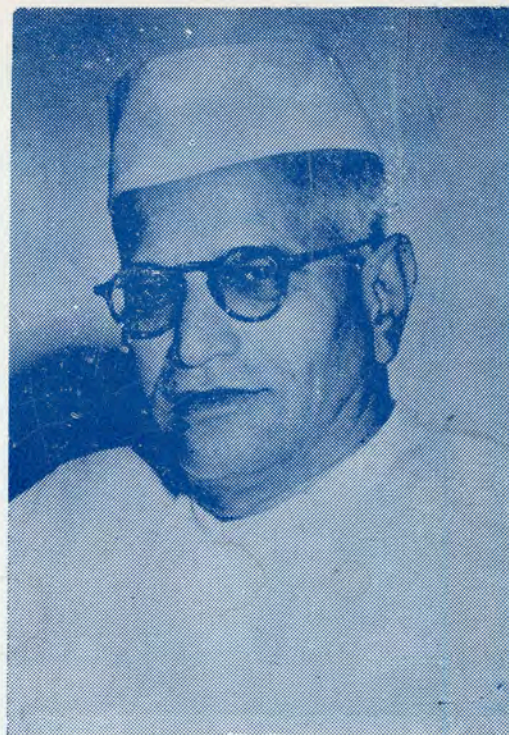
Sh N. V. GADGIL Governor of Punjab

We pray that its doors now opened by you to the sick and suffering persons may remain always open to them.